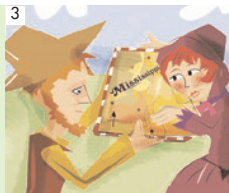
Pat and Tim look at the map.