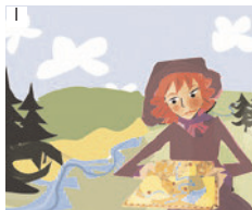
Pat and a map